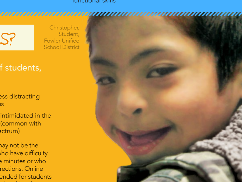
▶ Learn how PresenceLearning helped students with more severe disabilities at Fowler Unified School District.